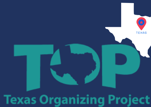
Texas Organizing Project